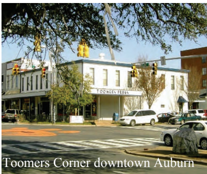
Toomers Corner downtown Auburn